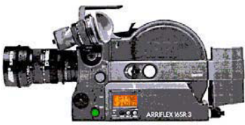
Arri SR III